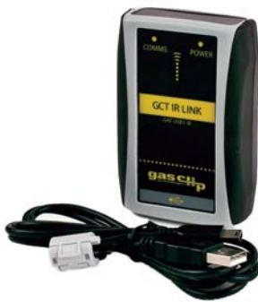
GCT IR Link