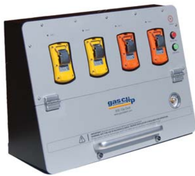
SGC Wall Mount Dock