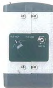
<H 2 S HIGH>

To measure high concentration Hydrogen sulfide (H 2 S), the model RX-517 applies a special H 2 S sensor with range 0-1,000ppm. When measuring high concentration H 2 S, turn the switch from "H 2 S LOW" to "H 2 S HIGH". This switch changes the LCD display, and unique flow path protects the other sensors from exposure to high concentrations of H 2 S.