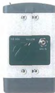
<H 2 S LOW>