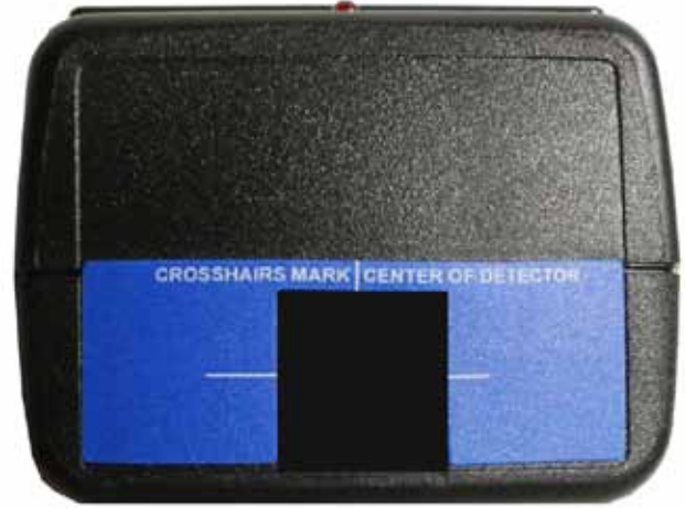
The end panel of the MC1K Shown