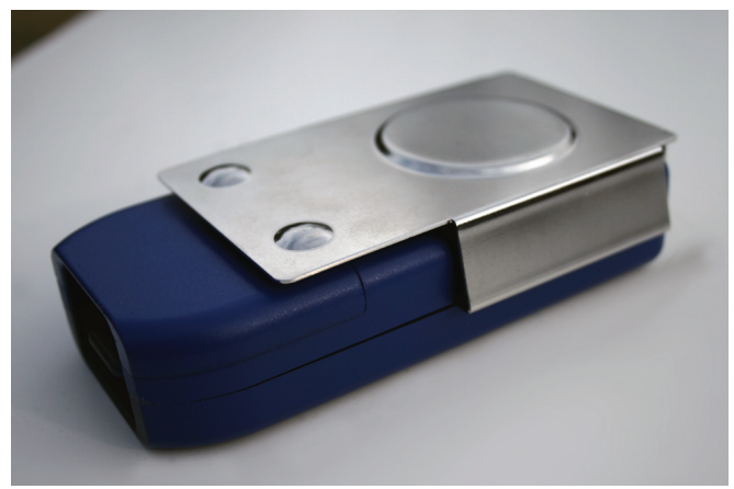
Wipe Test Plate