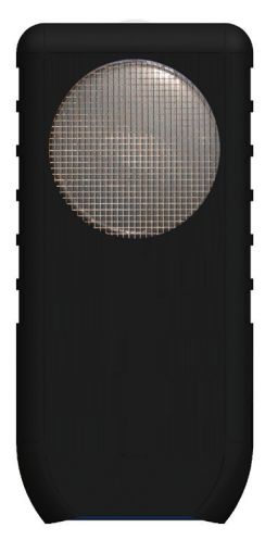
Ruggedized boot and Stand Included