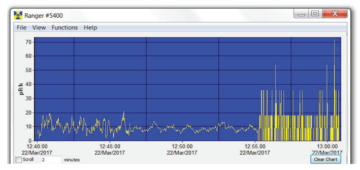
USB Observer Software collects data stored in the internal memory of The Radiation Alert Ranger