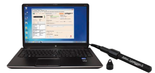
Fast communication and downloading speeds with a high speed Field Reader 5