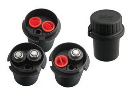
Levelogger 2" Locking Well Cap Installations (see Well Caps data sheet for more details)

The cap is vented to equalize atmospheric pressure in the well. It slips over the casing, and can be secured using a lock with a 9.5 mm (3/8") shackle diameter.