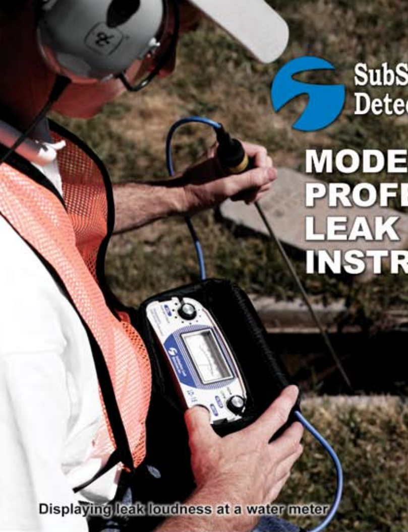
Displaying leak loudness at a water meter