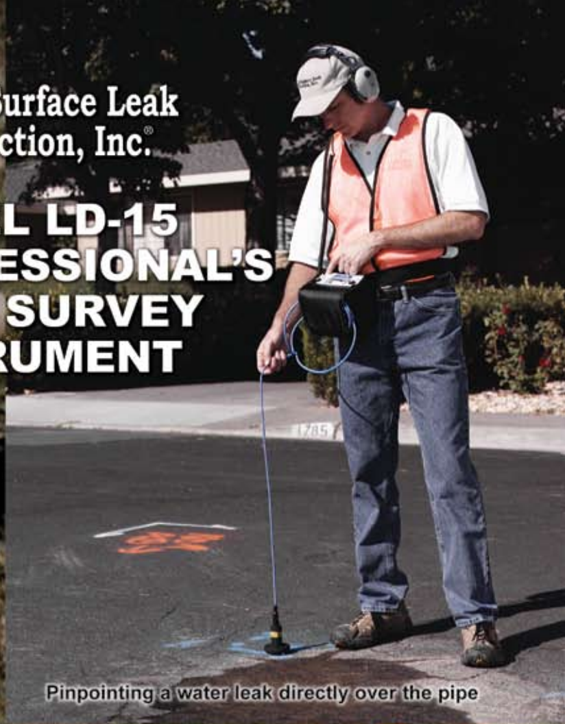
Pinpointing a water leak directly over the pipe