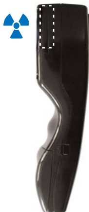
Illustration 2 MONITOR 4, 4EC, MC1K