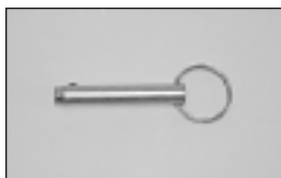
– Clevis Pin