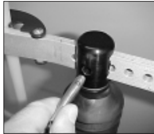
Clevis pin and clamp arm

clamp. Adjust the speed control knob to the minimum setting and check that the unit is switched off before attaching the power cord.