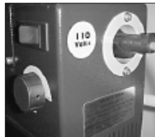
Speed control knob, on/off switch and plug