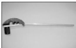
– Clamp Arm & Tubing Clamp Bracket