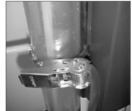
Ratchet tie-down belt

Open the Tubing Clamp located on the adjustable clamp arm and place the tubing in the clamp's jaws, leaving enough tubing (approximately 5 feet) above the jaws to allow the tubing to reach the tubing discharge clamp, and then tighten the clamp until the jaws are completely closed. The tubing clamp is designed to accept 1" OD, 5/8" OD and 1/2" OD polyethylene or Teflon tubing. Now position the tubing such that it will not chafe on the well casing and lock the clamp arm in place by inserting the clevis pin through the fork and the mating hole in the clamp arm.