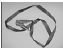
– Ratchet Belt